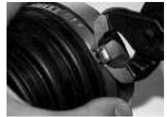
Step 4 Place the clamp over object. Engage interlocking hooks in tightest window position. Firmly crimp the ear with Oetiker pincers.