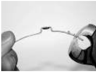
Step 1 Pre-shape clamp.