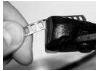
Step 3 Cut off the remaining material. To avoid possible injury deburr cut edges with a file.