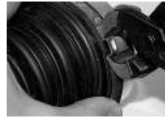
Step 4 Place the clamp over object. Engage interlocking hooks in tightest window position. Firmly crimp the ear with Oetiker pincers.