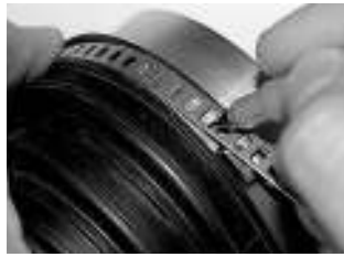
Step 2 Determine the clamp length.