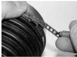
Step 2 Determine the clamp length. Make sure the end of the clamp passes the "ear", as shown.