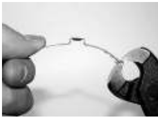
Step 1 Pre-shape clamp.