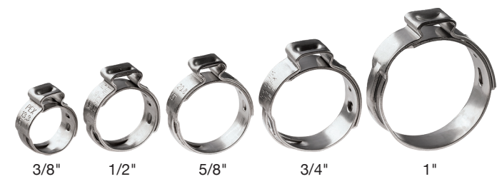
PEXGrip® Clamp Technology is available in all popular PEX tube sizes