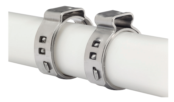
Standard PEX Clamp Series vs. PEXGrip® Clamp series